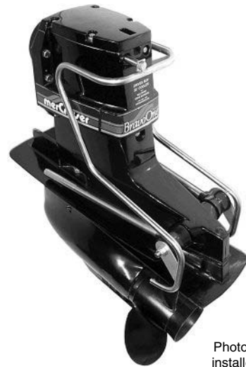
Photo shows Halo Max installed on Bravo Drive