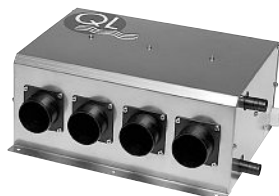
Dimensions: 10kW — 14-5/8" x 6-5/16" x 9-5/16"

The QL air heater extracts heat from the engine’s cooling system, which would otherwise be wasted, and transfers it into the cabin giving you a warm, dry and comfortable atmosphere, and you avoid frosted or misty windows. The QL air heater is highly efficient and can be installed vertically or horizontally. Its compactness makes it easy to locate anywhere. Stainless steel for the casing and copper/brass for the heat exchanger ensures long service. 12 volt.