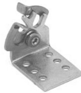
Dual Cable Clip 35531