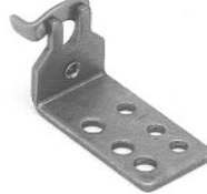
Cable Clip 31419