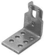
Cable Hook Clip 36174