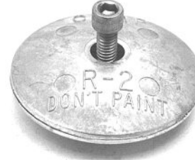
Brass Bushing for Permanent Ground