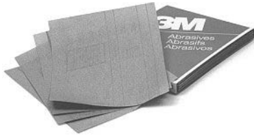
9" X 11" - A WEIGHT

Dry Sanding only by machine or hand on fiber-glass, wood or metal. Open coat with tough aluminum oxide mineral. Price is Per Sleeve.